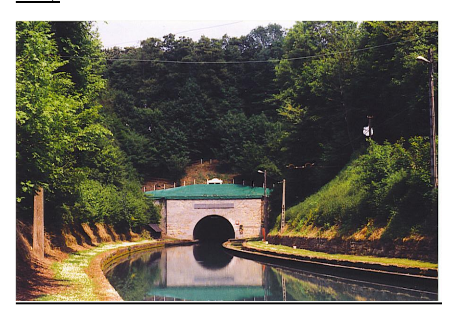
<u>Day 7, Friday, May 22, 2020: Honnecourt - Tunnel of Riqueval - St. Quentin (approx. 65 km/ 40 miles).</u>

We will once again enjoy a breakfast cruise, while the Fleur passes through the tunnel of Riqueval, (built from 1802-1810) enabling the barge to travel from the height of the Sommes Basin to the Escaut Basin. Like in former years, the barge will be pulled through the underground tunnel in two hours by an electric towboat. Our final destination of St. Quentin arose in the 2nd century on a junction of Roman roads. The lively provincial city was a destination for pilgrams to the grave of St. Quentin, a Roman Christian who was said to have been martyred there in the 3rd. Century.